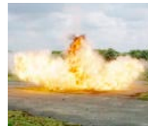
Fire Burst, 2005.

"Explosions," Sarah Pickering's debut solo show, is both as understated and as boisterous as its title implies. The British artist's eight large-scale photographs capture the pyrotechnics of various types of bombs and explosives, suspending the fiery or smoky bursts at the moment of simulated impact. The quality of each blast—land mine, smoke burst, electric thunderflash, and so on—is distinct not only in appearance but also in tone. Napalm produces a low-slung, compact gray cloud that menaces the flat, sullen British countryside; the ground burst, by contrast, emits a brilliant flash of sun and joyful rays of light that are incompatible with the quiet grassy landscape. Detonated on the proving grounds of the British military and police, the bombs are used to prepare troops for actual combat, and Pickering's images cleverly investigate "representation" and "real," and aesthetics and death, in photography and warfare. These explosions are the illusionist's light show and the soldier's shield. More subtly, however, they point to the fusing of these qualities, to misdirection's thrilling flash.